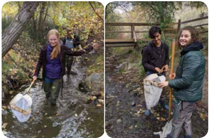
Figure 2. SKSS Students collecting aquatic invertebrates in Petersen Creek

So much of what we do with our students is in the classroom, so being able to take students outside, especially when teaching about the natural world, is a great opportunity. The fact that Petersen Creek is within walking distance of SKSS has opened up the ability to bring students there within the constraints of their tight schedules, as well as without having to rely on transport and its associated costs. We hope to continue with this project in the year to come.