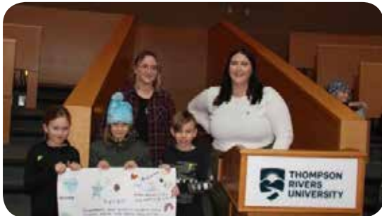
Right #19: Protection From Violence

In small groups, TRU students introduced and reinforced the Convention of the Rights of the Child. Each group was assigned one pre-determined right on which to support understanding of the right within a personal, local and global context. This understanding was articulated and enhanced through group-based art projects. These art projects were shared within our respective community of learners.