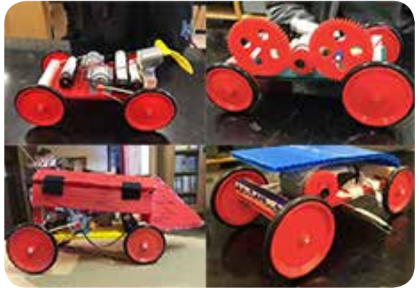
Some of the electric cars designed by the Grade 11 Physics students