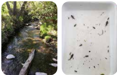
Figure 1. Petersen Creek (left) and stoneflies netted from the creek (right).

Before we began our sampling analysis we had a general discussion with the students about the creek, and its importance to the ecosystem.