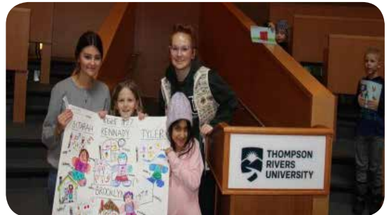
Right #27: Food, Clothing, a Safe Home