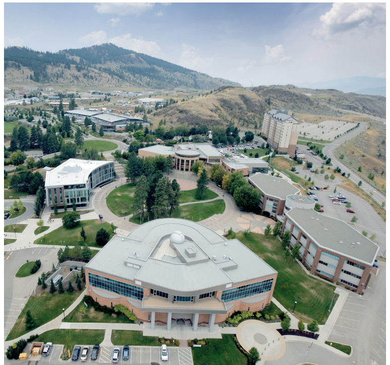
TRU Campus, located in the heart of Kamloops

For 30 years, Thompson Rivers University (TRU) has been delivering customized training programs of the highest calibre, earning us worldwide recognition. Our intensive, short-term programs are strategically balanced to maximize learning opportunities while allowing participants enough time to gain an appreciation of Canadian culture and participate in carefully selected activities. The result is a rich and rewarding experience that will last a lifetime.