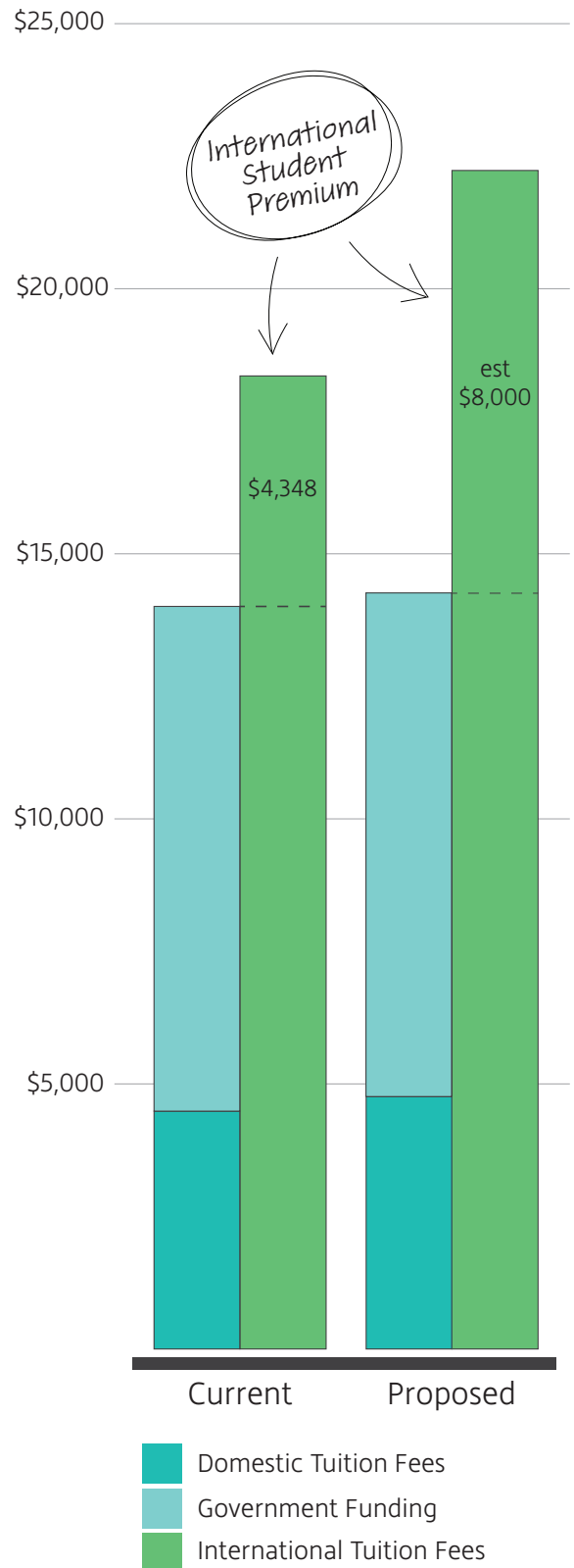
Figure 2. TRU Revenue Comparison

At TRU specifically, international students already pay a premium to subsidize the gap between an institutions' potential revenue and an institutions' desired expenditures. Currently a domestic undergraduate student at TRU pays $4,487.00 CAD in tuition fees per year. The government provides TRU with annual additional revenue of $9,520.00 CAD per full-time equivalent (FTE) student to subsidize their tuition, resulting in a complete revenue amount per domestic student of $14,007.00 CAD. Comparatively an international undergraduate student contributes $18,355.00 CAD in tuition, resulting in a premium of $4,348.00 CAD in revenue per student. This premium means that each international student is already contributing 23.7% more than a domestic student, even when accounting for government funding ( Figure 2 ). With the proposed 3-year strategy to increase international student tuition fees there will be an estimated 84% increase in the premium revenue every international undergraduate student generates. The proposed international graduate increase is even higher. It is the appropriate level of this premium that is at the heart of this discussion regarding the proposed TRU international student tuition increases.